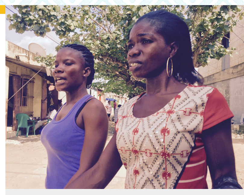
Young women in Abidjan, the largest city and economic capital of Côte d'Ivoire.

These objectives outline strengthened accountability through a multisectoral, multistakeholder platform; increased transparency at all levels; and enhanced inclusion of civil society in planning and budgeting for health.