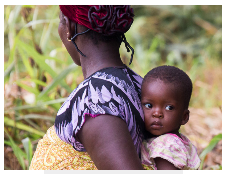
Young woman and baby in Côte d'Ivoire.

Donors and partners should increase efforts and continue to support CSO engagement in Côte d'Ivoire sustainably to ensure funding goes beyond coordination and communication efforts. It is our hope that this report will facilitate strategic CSO engagement and incite governments, the World Bank and partners to establish an enabling environment for all stakeholders as a key indicator of good governance and effective minimum standards implementation in GFF countries.